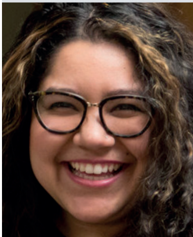
ASSOCIATE PASTOR FOR YOUNG ADULT AND YOUTH MINISTRIES