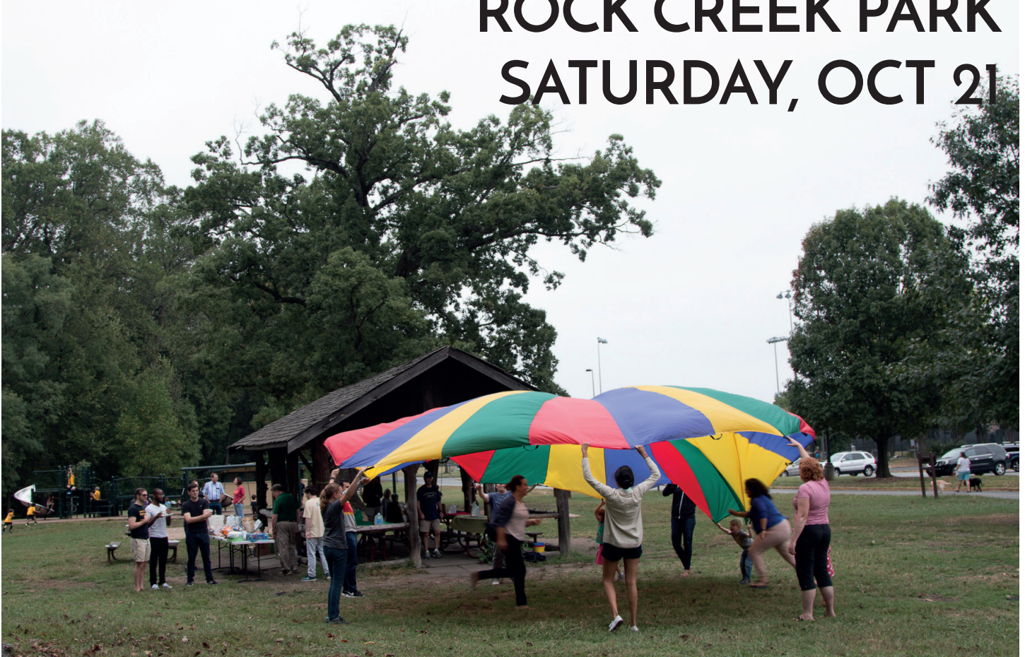
Photos From Last Year's Picnic

11:30am - 3pm in Rock Creek Park, site #24. Meats, tableware and beverages provided; please bring a side dish or dessert to share. Games, fellowship and fun to be had!