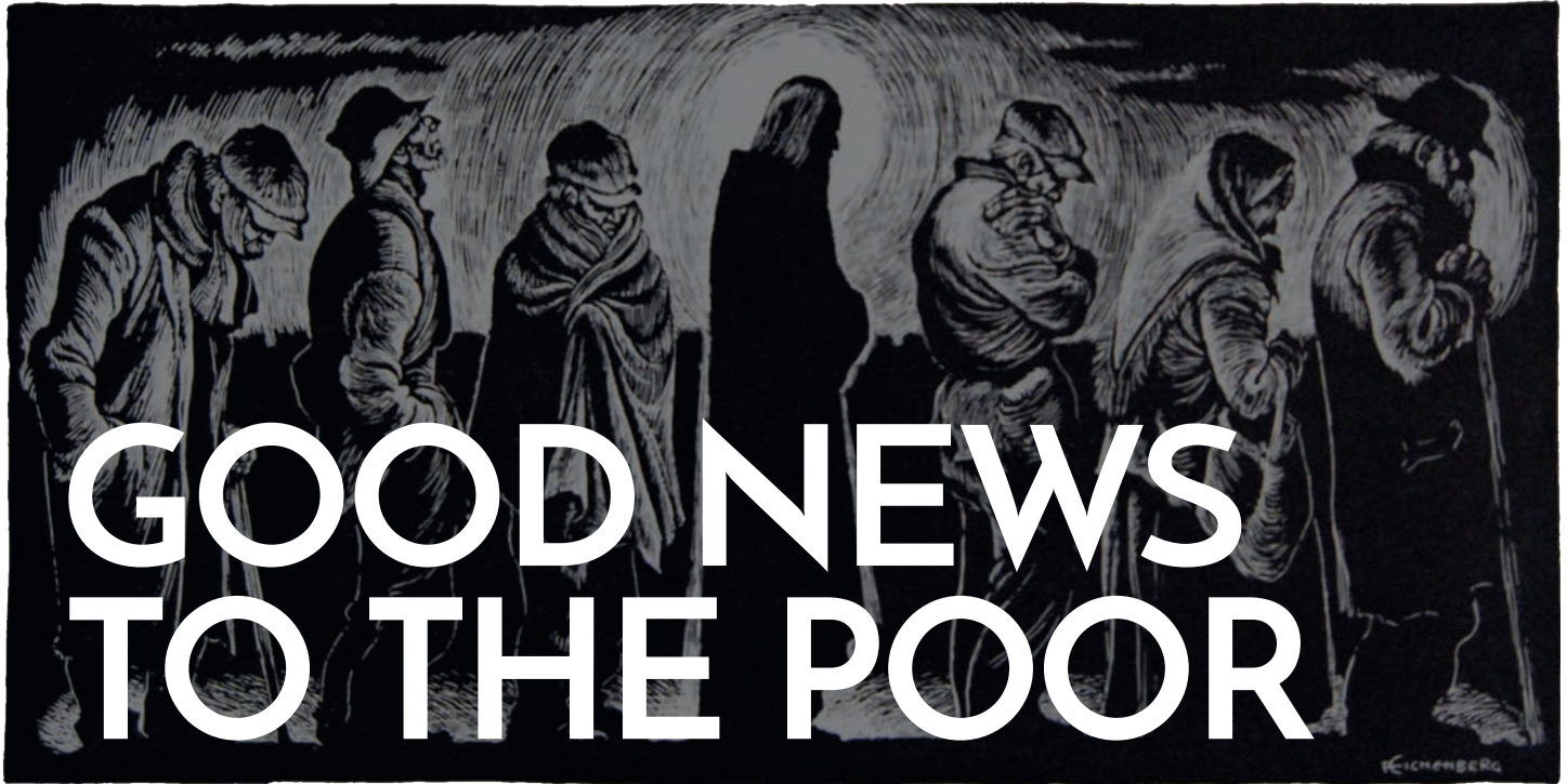
Christ of the Breadlines (by Fritz Eichenberg)

There came a defining moment for Jesus at the beginning of his public ministry. Showing up one sabbath day at his boyhood synagogue in Nazareth, he read to the congregation from the prophet Isaiah and, in that moment, declared his own agenda: