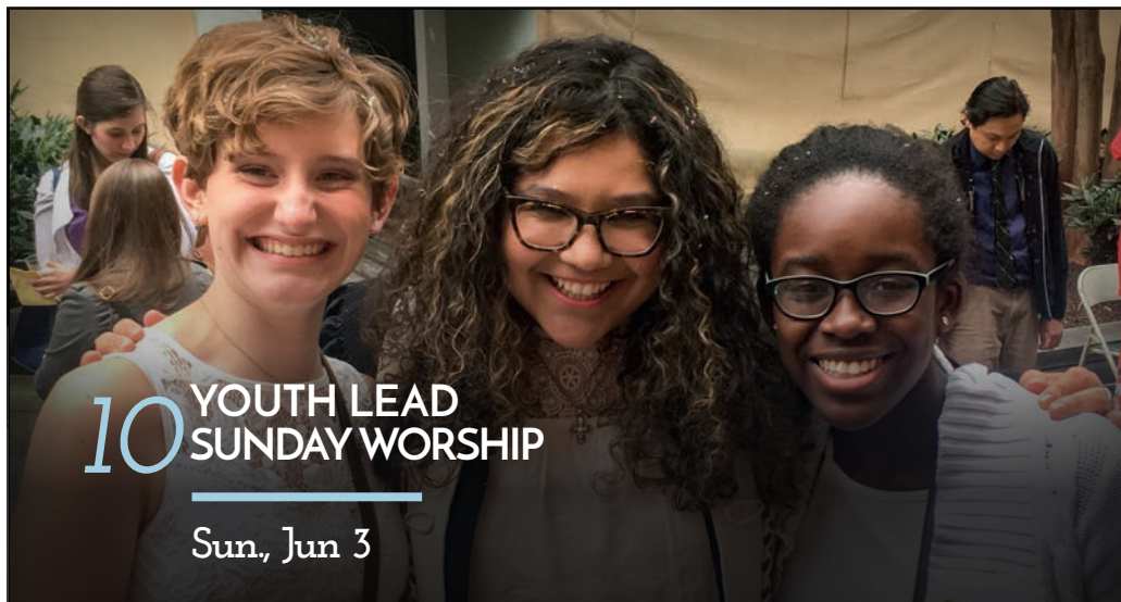
10 YOUTH LEAD SUNDAY WORSHIP